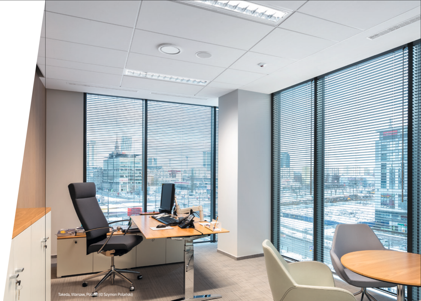
Takeda, Warsaw, Poland

To create environments that enhance lives in ways both practical and emotional. And to create spaces that can cope with the demands of the everyday and stand the test of time.