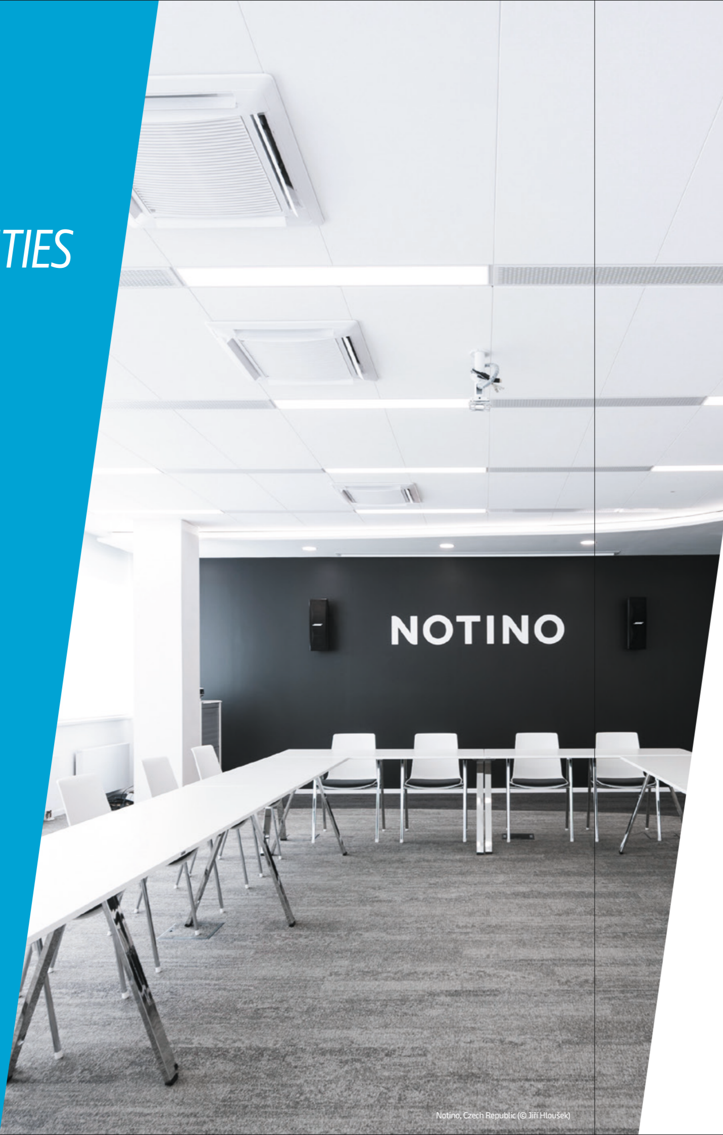
Notino, Czech Republic

Visually striking. Acoustically sound. Durable and long-lasting. But what makes ADAGIO so sought-after is something else entirely: creative flexibility. Incredibly versatile, ADAGIO gives you everything you need to design unique, iconic spaces, from open-plan workplaces that enhance productivity, to future-focused, inspirational learning centres. ADAGIO can be adapted, configured and combined to help you imagine greater possibilities and bring your vision to life.