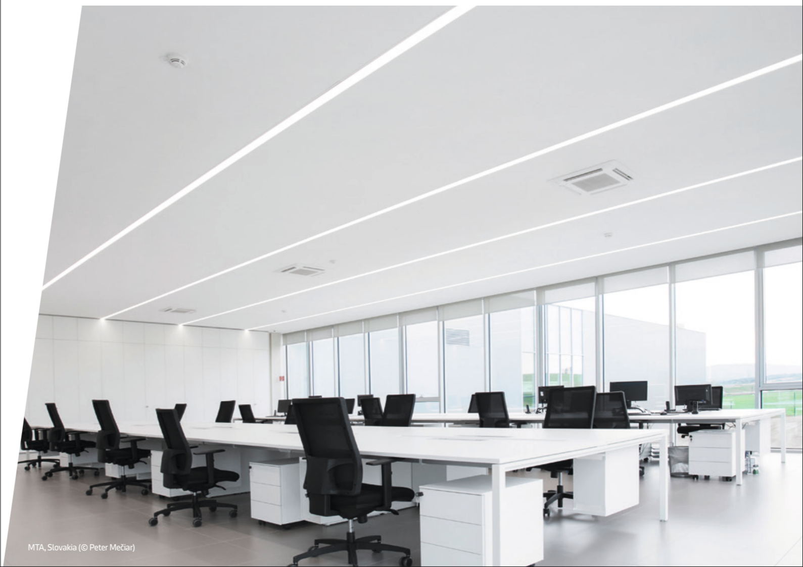
MTA, Slovakia