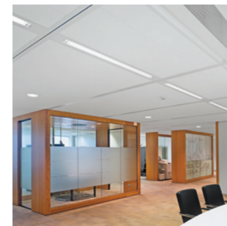
Van Oord Headquarters, Rotterdam, Netherlands

From exposed to fully concealed, ADAGIO can fulfil any design vision.