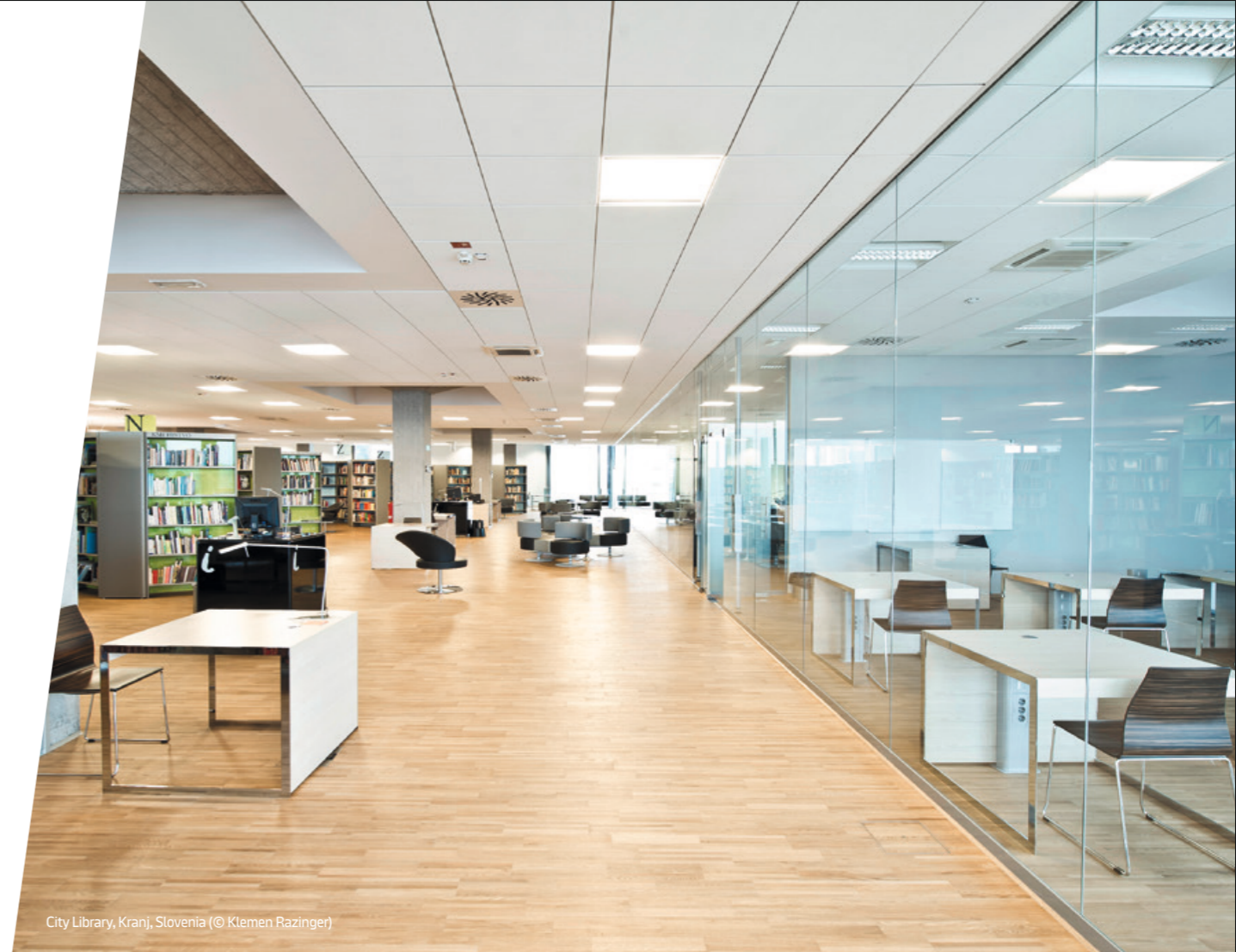
City Library, Kranj, Slovenia