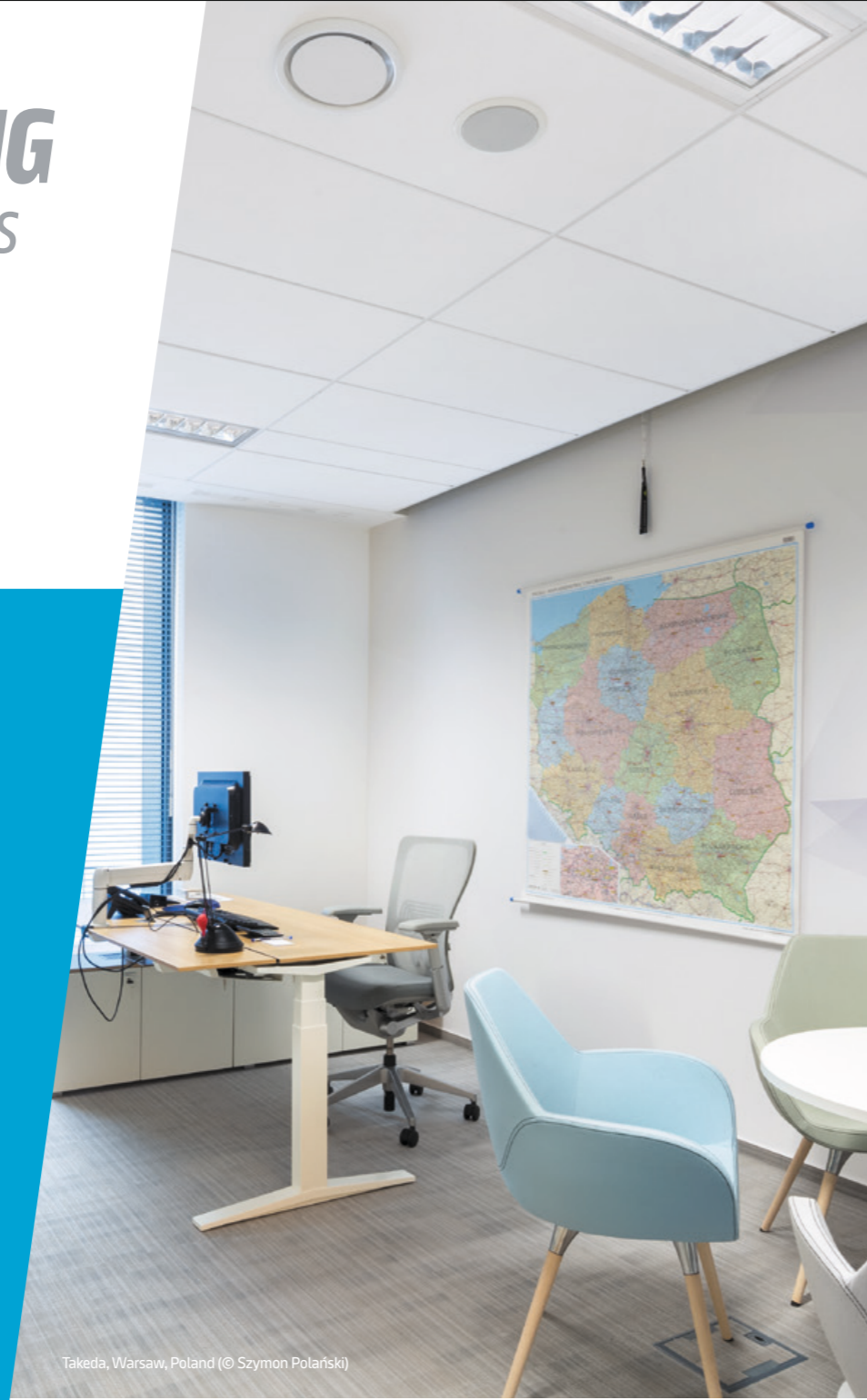
Takeda, Warsaw, Poland